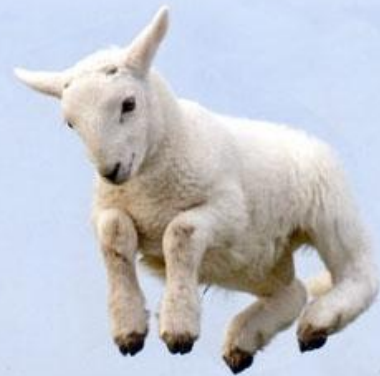
Spring lamb, © www.richardpeters.co.uk

Click here for more information on ELS or call 0300 060 1112 for ELS or 0300 060 1113 for (O)ELS .