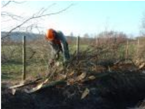
Laying a hedge in the Lancashire Style.