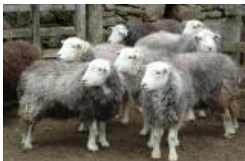
Herdwick ewes, Watendlath, Lake District © Natural England.