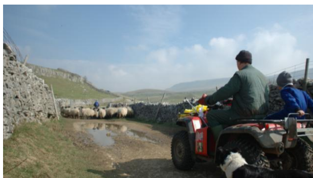
Gathering the flock, Yorkshire Dales.

In December, Defra announced details of the new Upland ELS (UELS) and transitional arrangements to smooth the transition from the Hill Farm Allowance (HFA) to the new scheme. Key points are:-